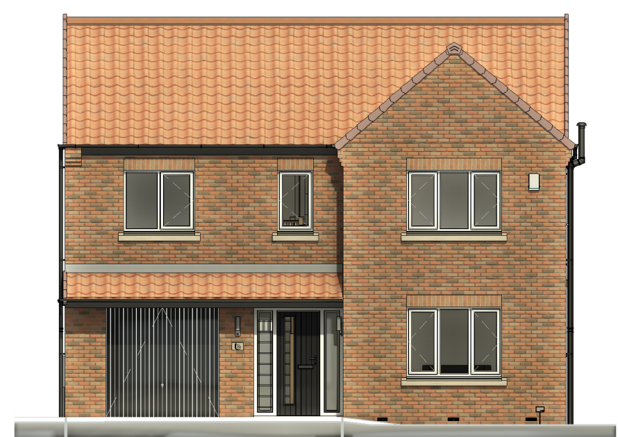
Front Elevation. 1 : 100