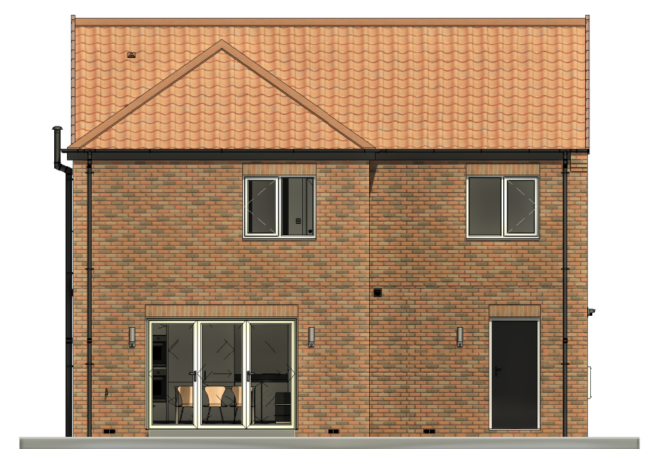
Rear Elevation. 1 : 100