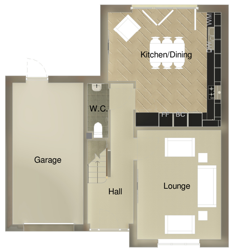
Ground Floor. 1 : 100