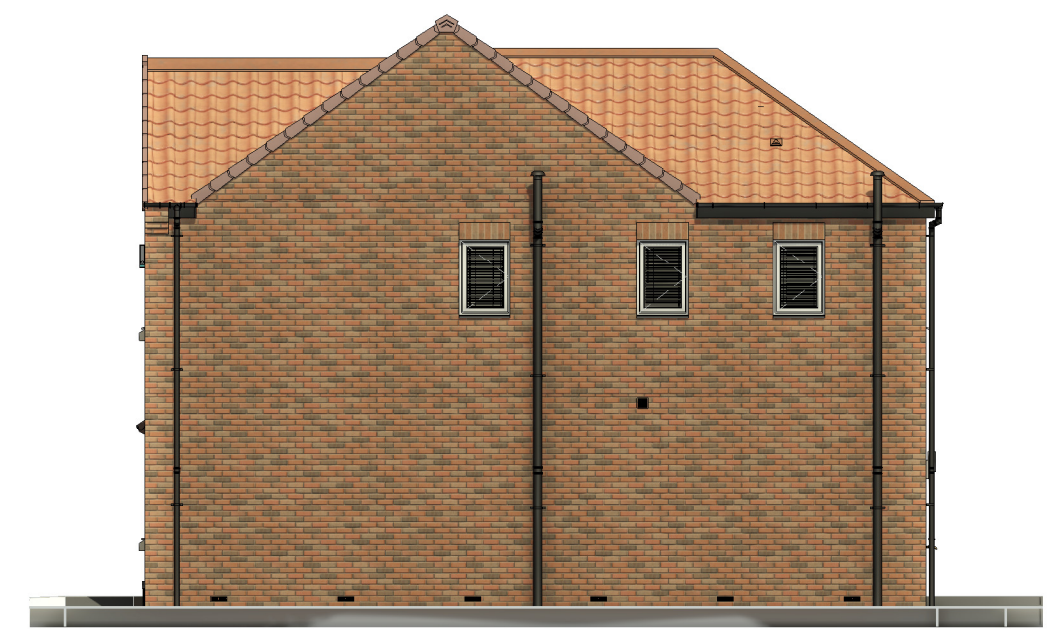
Right Elevation. 1 : 100