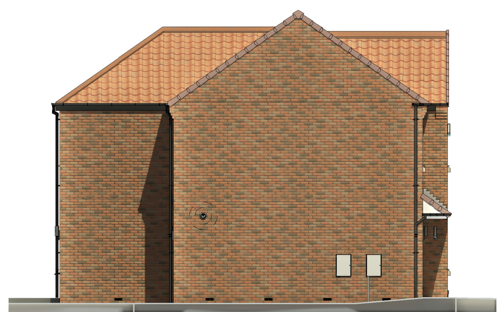
Left Elevation. 1 : 100