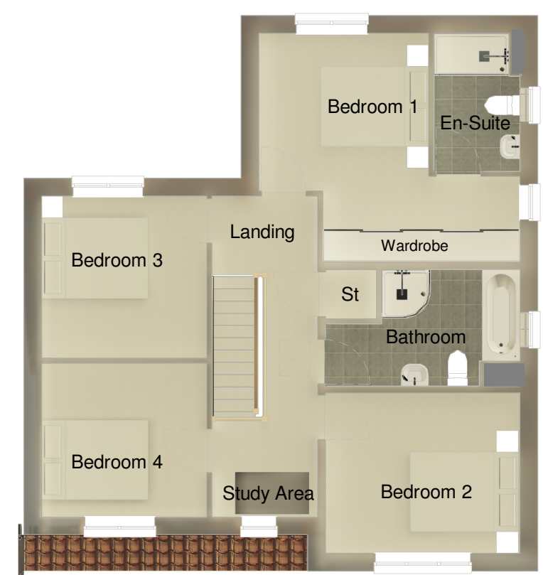
First Floor. 1 : 100